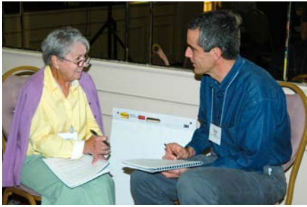
One-on-one interviews took place in person and via phone and video calls.